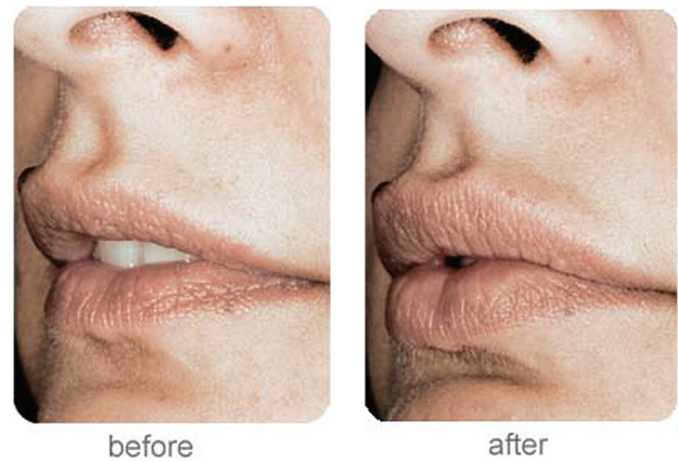
Figure 8 A clinical example of the use of Puragen™ for lip augmentation.