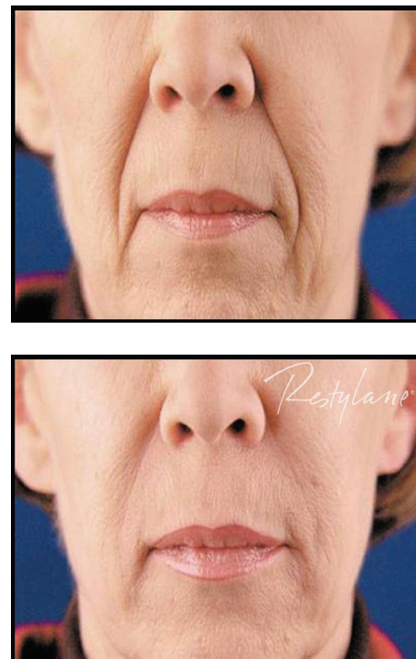
Figure 3 A clinical example of the use of Restylane® for nasolabial folds.

The last of the HA fillers currently available is known as Juvederm™. It is manufactured by Lea Derm, a subsidiary of Corneal Group (Paris, France). It was developed in the US by Inamed® (Santa Barbara, CA, US) and currently is marketed by Allergan, Inc. (Irvine, CA, US). Two current formulations of Juvederm™ are available in the US – Juvederm™ Ultra and Juvederm™ Ultra Plus. Six different formulations of Juvederm™ have been developed, with differing concentrations of HA in each formulation, ranging from 18 mg/g to 30 mg/g. The two available US products contain 24 and 30 mg/g of HA, respectively, and are known as high