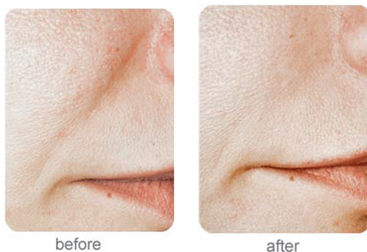
Figure 7 A clinical example of the use of Puragen™ for nasolabial folds.

Puragen™ Plus in the US. Puragen™ is currently available in Europe. Both Puragen™ and Puragen™ Plus, the first HA filler with lidocaine added, are double cross-linked, which may prove of value in increasing the resistance to the degradation of the HA filler. They are both non-animal derived HA fillers (Medical Insight Inc 2006). Puragen™ Plus contains 20 mg/g HA and its pivotal clinical trial was the first in the US to evaluate one HA filler, in this case Puragen™ Plus, versus Restylane® in the other nasolabial fold. Clinical trial results are not yet available but the European experience shows that this filler probably lasts from 6 to 12 months. Local adverse reactions, similar to those of the other HA fillers, have been noted as well. The addition of lidocaine gives Puragen™ Plus its hook that is its differentiator and only time will tell whether it will be of clinical significance. Clinical examples of Puragen™ are shown in Figures 7 and 8.