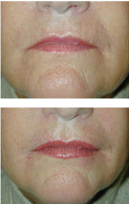
Figure 1 A clinical example of the use of Hylaform® for lip augmentation.

The second FDA-cleared HA filler is known as Captique (Genzyme, Inamed, Allergan; now Mentor Corporation, Santa Barbara, CA, US). It was developed utilizing Genzyme’s proprietary non-animal stabilized HA technology. This averted the potential immunological problems associated with the previous avian source for the HA fillers. It received FDA clearance in December, 2004. It is cross-linked with divinyl sulfone, is 20% cross-linked, contains 4.5–6.0 mg/mL HA, and a gel particle size of 500 \mu\text{m} . It is a clear, colorless gel that has its indication for fine lines and wrinkles of the face. Skin testing is not required prior to its injection. The duration of effect is typically felt to be anywhere from 3 to 6 months (Matarasso et al 2006). An example of Captique™ is shown in Figure 2.