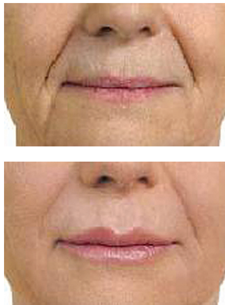
Figure 5 A clinical example of the use of Juvederm™ for nasolabial folds.

Other HA fillers are in development in the US and should receive FDA clearance over the next several years. Mentor Corporation (Santa Barbara, CA, US) is primed to launch