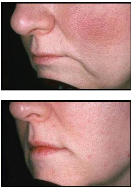
Figure 4 A clinical example of the use of Restylane® for nasolabial folds.

viscosity HA fillers. They were FDA approved in June, 2006 – Juvederm™ Ultra for deep wrinkles and defects, Juvederm™ Ultra Plus for deeper furrows, such as the nasolabial folds. The Juvederm™ family is produced from the bacterial fermentation of equine streptococci. The HA is cross-linked with a patented single-phase BDDE-phosphate buffered to 6.5–7.3 pH. With a higher concentration of HA and more cross-linking than other HA fillers, it is felt by some injectors that perhaps the Juvederm™ family of products may persist longer than other HA fillers and have a more smooth injection flow (Medical Insight Inc 2006), although clinical studies documenting these claims have not been performed in a head-to-head comparison against any of the other available HA fillers.