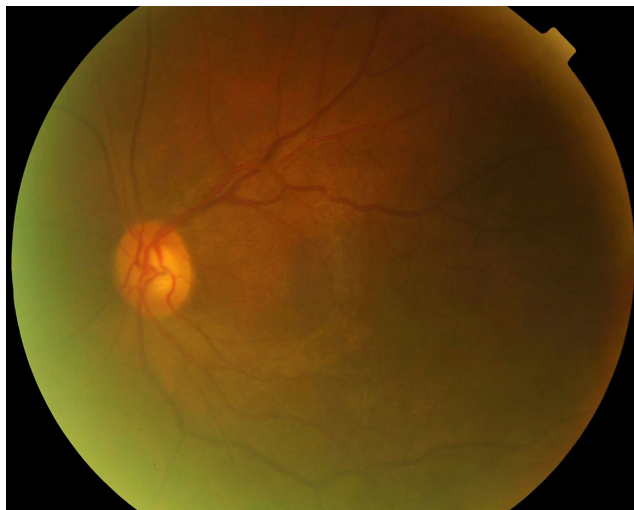
Figure 1 An image of the fundus on initial presentation in case 4. The epiretinal membrane is evident over the macula.

Here we report four cases of endophthalmitis after 25-gauge PPV performed by the same surgeon at our institution. The 25-gauge PPV procedure was introduced in August 2004 at our hospital. Since then, 502 cases have been treated by the same surgeon up to December 2010. The rate of endophthalmitis after 25-gauge PPV was 0.80% during this time period (four of 502 eyes). Hu et al 1 reported an endophthalmitis incidence rate of 0.07% after 25-gauge PPV (one of 1424 eyes). Other reports include those of Scott et al 4 (0.84%; 11 of 1307 eyes), Shimada et al 5 (0.03%; one of 3343 eyes), and Chen et al 6 (0.23%; one of 431 eyes). The rate observed in our institution was similar to that in the study by Scott et al. 4