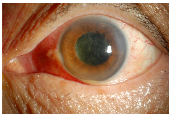
Figure 3 An image of the anterior chamber of case 4 on postoperative day 4. Hypopyon and fibrin have developed in the anterior chamber.

Interestingly, four cases of endophthalmitis after 20-gauge PPV occurred during the same time period in our institution. However, direct comparison of cases treated with 20-gauge PPV and those treated with 25-gauge PPV was impossible because of differences in surgeons and underlying diseases.