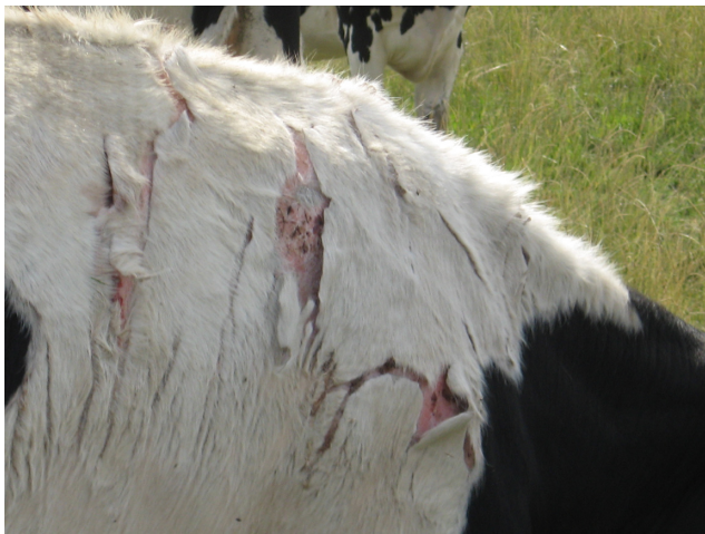
Figure 5 Photosensitization resulting from microcystin exposure. Notes: Microcystin toxicoses resulted in acute deaths in 15/200 Holstein heifers in California's Central Valley. Approximately 10% of the cattle developed hepatogenous photosensitization. Microcystin-LR was identified in pond water contaminated with Microcystis sp.

therapeutic intervention quite difficult, and high mortality rates results. No specific therapy has proven effective in laboratory animals, including decontamination with activated charcoal and no data exists for adsorptive capacity in other animals. 101 Symptomatic and supportive care to treat hypovolemia and electrolyte imbalances, and antioxidants such as vitamin E and selenium should be included in the therapeutic regimen for cattle poisoned with microcystins. Cattle with photosensitization must be protected from sun exposure.