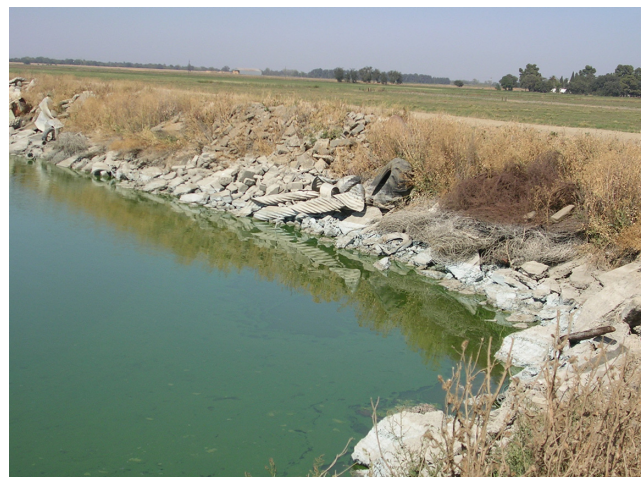
Figure 4 Pond with Microcystis bloom in California's Central Valley.

Increasing global water temperatures, nutrient and pollutant enrichment lead to eutrophication of fresh and coastal water bodies and can result in toxicogenic cyanobacterial (blue-green algae) blooms. Produced by multiple cyanobacteria, microcystins have been detected worldwide, resulting in numerous animal intoxications. These algal toxins present a constant threat to pastured animals because of their persistence in ponds and streams (Figure 4). Cattle drink contaminated water readily, even consuming algal mats, and poisonings appear to be on the rise. The number of structural variants frequently present in surface water blooms makes estimating toxicity difficult. Cyclic heptapeptides causing acute liver damage through potent inhibition of protein phosphatases 1 and 2A, 98 microcystins result in diarrhea, weakness, pale mucous membranes, and shock within 30 minutes to several hours. 99,100 Many die within hours to days, but individual cattle may survive and develop hepatogenous photosensitization (Figure 5). The rapid onset of acute hepatotoxicosis renders