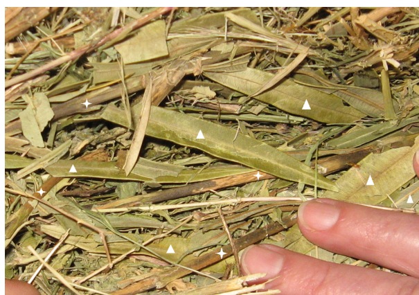
Figure 3 Oat hay contaminated with oleander ( Nerium oleander ). Oleander leaves (▲). Oleander stems (+).

One of the authors has observed transfer of oleandrin into milk of dairy cattle and into edible tissues of poisoned cows. Therefore, specific toxicology work-up of suspect oleander poisonings must address the public health risk. With zero tolerance for oleandrin in edible tissue, any detection is considered unsafe and the product adulterated. Oleandrin has been detected in milk samples for several days after exposure, while muscle tissues may remain positive for up to 10 days, albeit at low ng/g concentrations. Consultation with a toxicologist and confirmatory testing are imperative