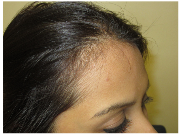
Figure 2 Temporal thinning, early FPHL.

Notes: A patient with family history of androgenetic hair loss, no medical history, and no prominent scalp findings except for a bilateral temporal thinning.