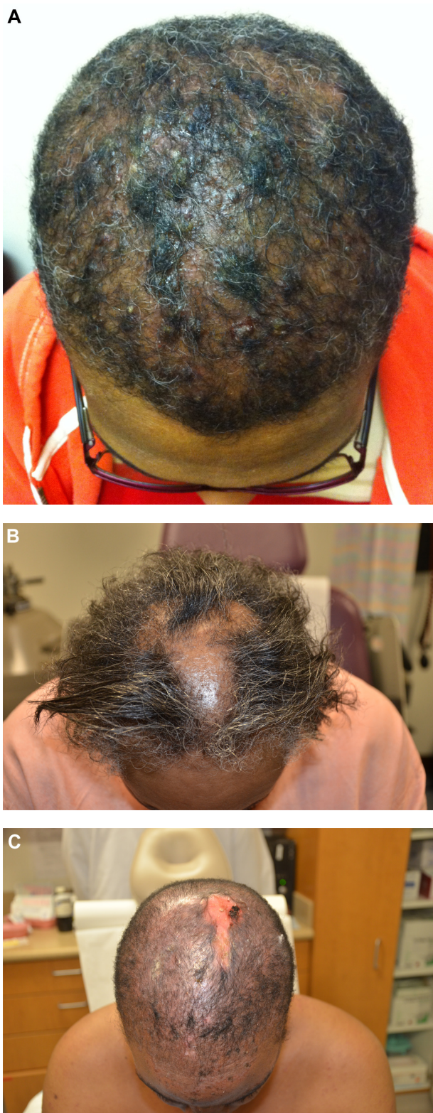
Figure 3 Scarring Alopecias. Notes: (A) Dissecting cellulitis. Multiple indurated plaques and nodules with serous drainage and crusts and scarring on the scalp. Trapped and broken hairs, loss of follicular ostia, and boggy areas are appreciated. (B) Central cicatricial centrifugal alopecia. Patch of alopecia on the central scalp with scarring in a patient with previous history of chemical treatments for many years. (C) Discoid lesions of systemic lupus erythematosus. Scarring alopecia of the scalp with a distinctive background of a faint pink perifollicular erythema.