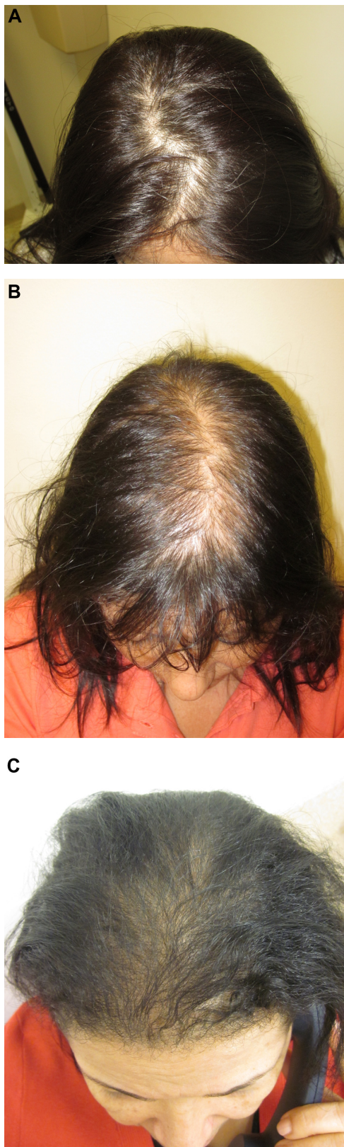
Figure 1 Ludwig I–III. Notes: (A) Ludwig I. Mild decrease in hair density on the crown with a barely perceptible increase in the part width. (B) Ludwig II. Moderate decrease in hair density on the crown with noticeable increase in part width. (C) Ludwig III. Severe decrease in hair density on the crown with almost no perceptible part width and thinning of the frontal hairline.