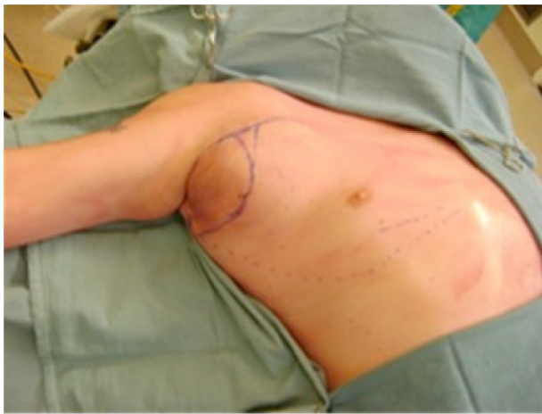
Figure 1 Preoperative curvilinear marking.

of the dominant perforators from the internal mammary. The pectoralis major was then separated from the serratus anterior and the pectoralis minor (see Figure 2). The lateral thoracic and pectoral branch of the thoracoacromial vessels remained intact and preserved.