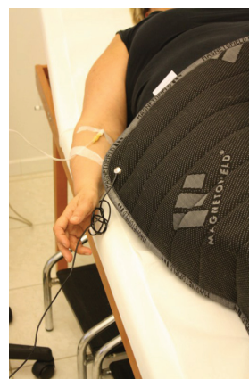
Figure 1 Patient undergoing PEMF therapy (right leg). Abbreviation: PEMF, pulsed electromagnetic field.