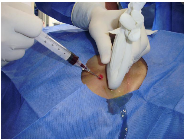
Figure 2 Ultrasound guidance axillary vein cannulation.

In the 15 years and 8 months of the study, nonclinical evidence for axillary vein stenosis was found, but it is important to note that the maximum usage time was observed in patients with a previous catheter as a guide, at 216 \pm 222 days.