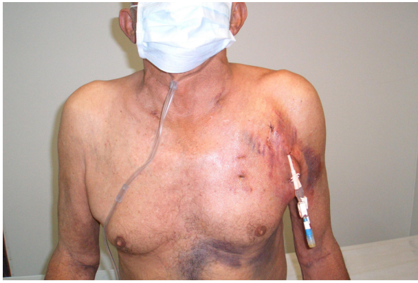
Figure 1 Long-term catheter in axillary vein.