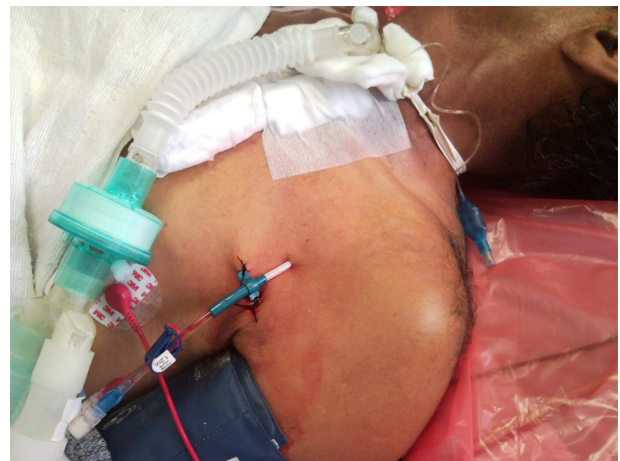
Figure 4 Axillary vein implantation in patient with tracheostomy.