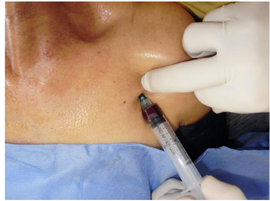
Figure 3 Palpation technique axillary vein cannulation.

nephropathy, and the main causes of acute kidney injury were acute tubular necrosis associated with renal ischemia and sepsis. Sixteen catheters were long-term (Figure 1), and 66 were temporary. In 41 procedures, the ultrasound-guided technique was used (Figure 2); in 19, the anatomical reference technique was used; in 15, the palpation of the axillary artery was used (Figure 3); and in the remaining 8 cases, the catheter was placed over a vein previously cannulated by another axillary catheter (usually when a temporary catheter was replaced by a permanent one). The main factor that prompted the use of axillary vein access in the ICU was the presence of a tracheostomy (Figure 4); in the RCF, it was the impossibility of obtaining any other access or practicing arteriovenous fistula or graft (Table 2).