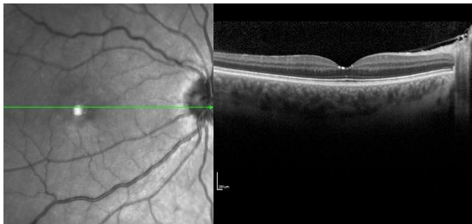
Figure 3 Horizontal scan with optical coherence tomography through the fovea. The foveal depression shows several hyperreflective structures as a sign of crystalline retinopathy.

Tamoxifen is a selective estrogen receptor modulator that is used as an adjuvant therapy for breast cancer. Between 0.6% and 12% of patients experience damage to ocular structures. 57,58 Classically, side effects of the eye include crystalline retinopathies, which do not usually lead to visual disturbances. The crystalline deposits focus in the macular area (Figure 3), but can also occur in the peripheral retina. 59 With the advancement of optical coherence tomography (OCT), there are also reports in which crystalline retinal deposits occur along with structural changes in the macula. The most common is a cystoid structure without evidence of macular edema. This can also occur without crystalline changes and leads to a pronounced loss of vision. 60 The mechanism of this condition is unknown. It is controversial whether selective hormone medication leads to an increased risk of vitreoretinal traction; conclusive proof has not yet been provided. 61 Macular edema with severe visual loss is also one of the classic appearances of tamoxifen associated retinopathy. 62 It has been described mainly in patients with a high total cumulative dose. An Australian research group reported the occurrence of a macular hole with a frequency of 4.12% in patients treated with tamoxifen compared to 0.8% in the normal population. It should be noted that breast cancer patients may also have other risk factors for development of a macular hole. 63 Due to the rarity of the injury picture,