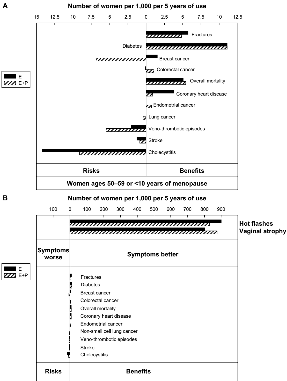
Figure 2 (A) Risks and benefits of MHT (expressed as attributable or excess risk) in women starting MHT between the ages of 50 and 59 years or less than 10 years after the start of menopause. Figure expanded from panel B for clear visualization. (B) Number of women expected to get hot flashes and vaginal dryness symptom benefit per 1,000 women taking MHT for 5 years. Design of panels A and B is the same. Panel B compares the number of women benefiting from relief of symptoms of hot flashes and vaginal atrophy with the number of women experiencing other risks and benefits.

the balance of benefits and risks individualized to each woman's particular health circumstances is generally advised. Annual reassessment typically includes a clinical breast examination, mammogram (for women 40 years and older), pelvic examination (if indicated), symptom