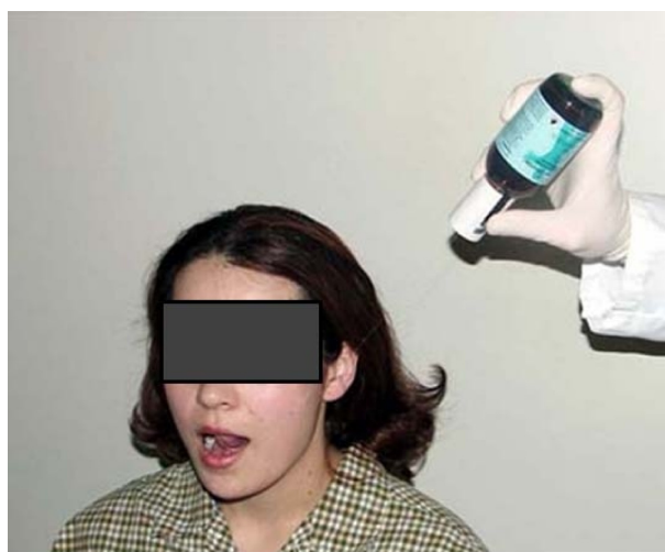
Figure 1 Jaw N-stretch with vapocoolant spray.

Medications are an effective addition in managing the symptomatology of intracapsular disorders. 1 Commonly used pharmacological agents for the treatment of TMJ disorders include analgesics, nonsteroidal anti-inflammatory drugs (NSAIDs), local anesthetics, oral and injectable corticosteroids, sodium hyaluronate injections, muscle relaxants, botulinum toxin