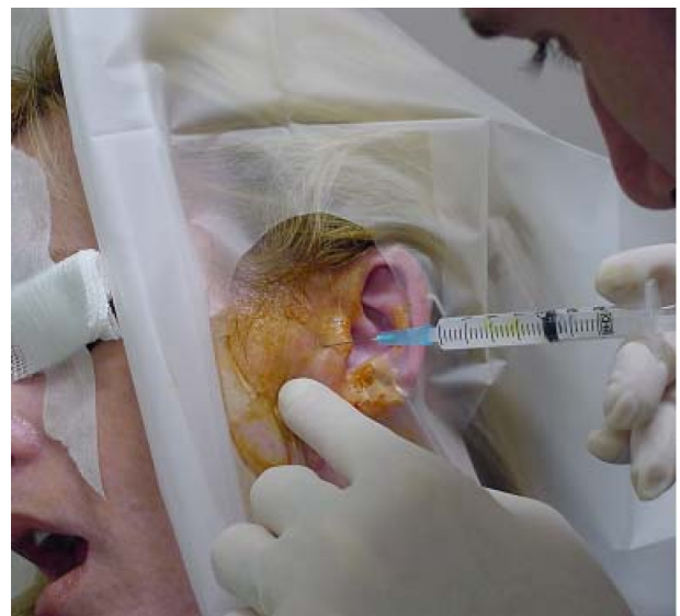
Figure 2 Temporomandibular joint injection.

Tricyclic antidepressants like amitriptyline and nortriptyline may be used for more chronic MFP. 21,31 In addition, they can be prescribed for the TMD patient who has tension-