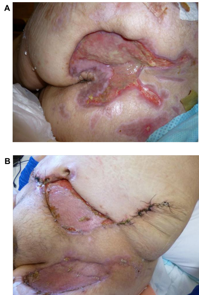
Figure 3 After treatment with immunosuppressive medications, appearance of sacral (A) and abdominal and left thigh (B) pyoderma gangrenosum.

To aid the recognition of PG, Su et al 1 proposed a set of diagnostic criteria for ulcerative PG. Diagnosis requires both major criteria and at least two minor criteria. The major criteria include the characteristic appearance of a painful, irregular ulcer with a violaceous border, and exclusion of other causes of ulceration such as malignancy, vasculitis, primary infection, and drugs. The minor criteria include history of pathergy, associated systemic illness, histology findings of dermal neutrophilia, and response to steroid treatment. Other diagnostic