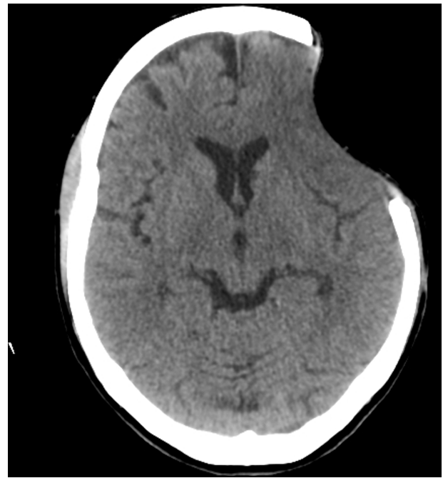
Figure 2 Cranial computed tomography before performing cranioplasty.

Six months after surgery, the patient reported complete resolution of symptoms, without changes in motor examination, and a subjective report of improvement in verbal fluency. Neuropsychological assessment before and after cranioplasty showed improvement in memory capacity, language, executive functions, and activities of daily living