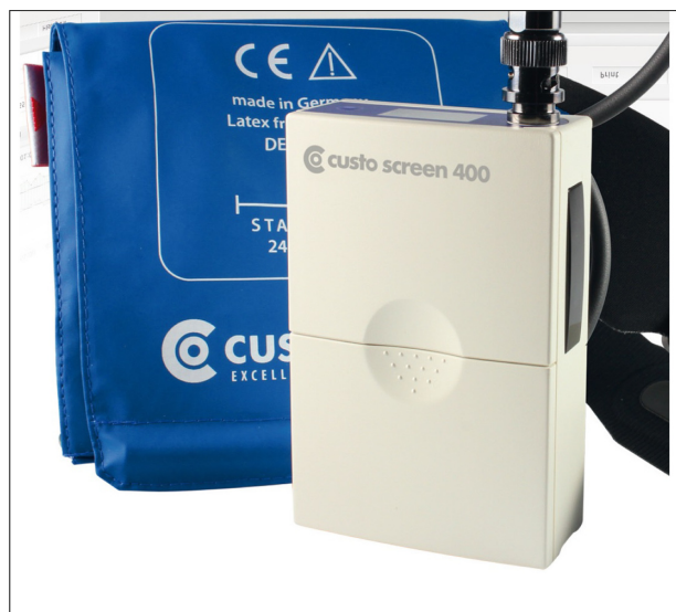
Figure 1 Custo screen 400 test device.

To initiate ABPM, the custo screen infrared interface must be connected to the computer and be ready for operation. After selecting a subject, different parameters have to be set, including measuring intervals (standard or customized), time for day and night phases or additional phases, the option for repeated measurements, signal before measurement (beep), display results, and print diary. The display of the device indicates systolic and diastolic BP (SBP and DBP, respectively) values together with heart rate and an error code in case of failure. When the measurements are complete, data are downloaded via an infrared interface. The quality of the recording, including invalid measurements and their underlying causes, can be checked.