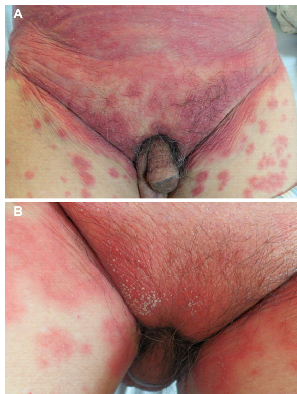
Figure 2 (A) Erythema and lots of tiny pustules on the abdomen. (B) Many pustules on the basis of erythema on the lower abdomen.

Case 3 was a 62-year-old woman with a 5-day history of generalized erythema and papules with itching. She had a fever of 38.7°C. On the day before appearance of the skin rash, the patient had received her first injection of