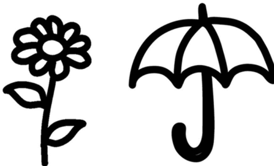
Figure S1 Examples of pictorial stimuli in the pictorial memory test: flower (left) and umbrella (right).