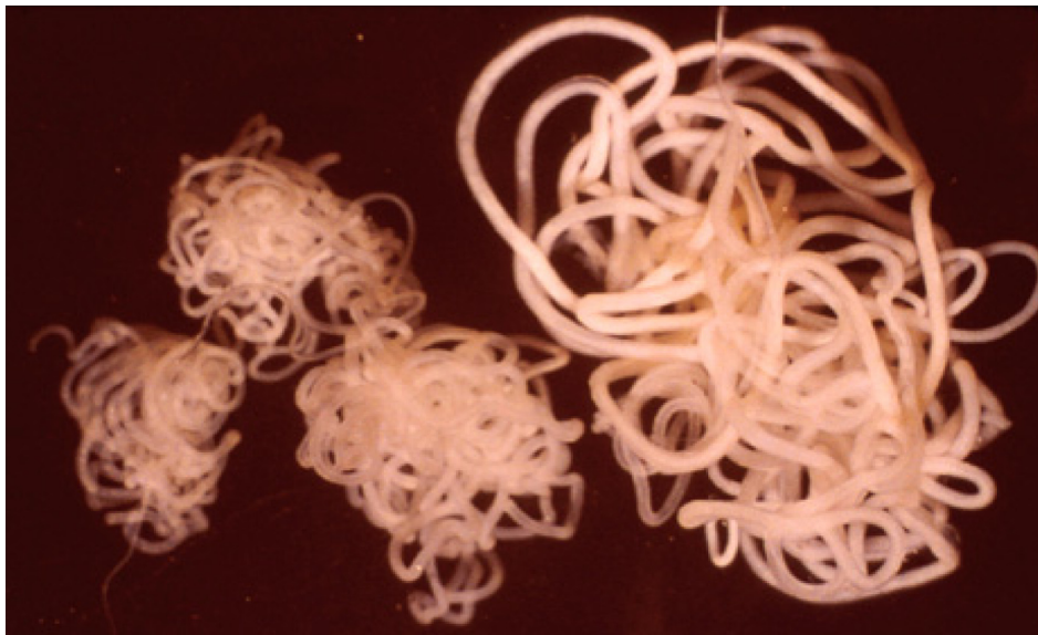
Figure 1 Onchocerca volvulus filarial parasites (three adult males and one adult female).

of overt disease, brought infection to the point of elimination of its transmission, and begun to break the infection cycle permanently in many areas. The use of the MDA approach with ivermectin, for the first time with onchocerciasis, has changed the face of tropical medicine and the provision of health care services to populations that have been the most under-served in the world. A concerted global effort is now underway to finally eliminate onchocerciasis, along with other parasitic diseases such as lymphatic filariasis, from their respective endemic areas. Elimination, ie, breaking of transmission for 3 years at unsustainably low levels, 1 has now occurred in Colombia 2 and Ecuador 3 as well as in specific endemic foci in Africa. 4 Other countries are likely to reach the state of complete breaking of transmission, especially in Latin America where, for example, Mexico is poised to join the successes of Colombia and Ecuador. 5,6 Indeed, this is a most exciting time in tropical medicine, when such possibilities as elimination are even considered as achievable goals. This review summarizes the path taken to this point with regard to the chemotherapeutic treatment of river blindness, and suggests some ways that it may change as we approach the goal of elimination of onchocerciasis as a public health concern by 2025. 7