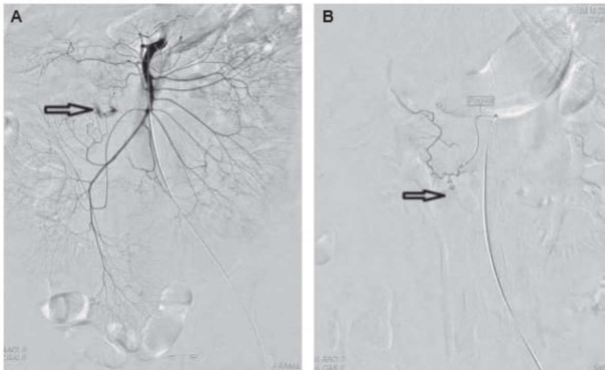
Figure 2 Mesenteric arterial angiography.

Notes: Initial angiography ( A ) showed a hemorrhage spot in the initial branch of the superior mesenteric artery (indicated by arrow). Selective arterial embolization with gelatin sponge was performed and final angiography ( B ) demonstrated no signs of arterial bleeding (indicated by arrow).