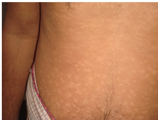
Figure 1 Macular form of post kala-azar dermal leishmaniasis.

Current literature shows that PKDL is most common in Sudan and Bangladesh. 10 PKDL also occurs among cured VL patients in India, Nepal, and Ethiopia. However, the incidence is less in these countries than in Sudan and Bangladesh. 10 PKDL incidence among sodium