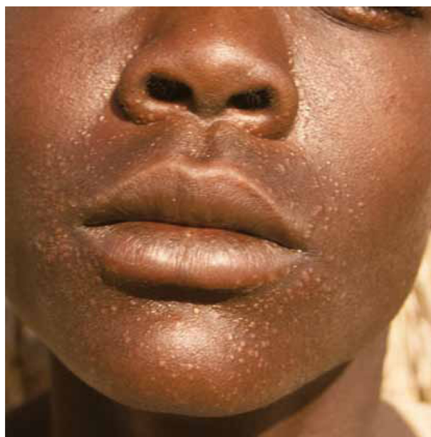
Figure 2 Papular post kala-azar dermal leishmaniasis.

Notes: Reproduced from The Post Kala-azar Dermal Leishmaniasis Atlas: A manual for health workers . Zijlstra EE, Alvar J. Geneva: World Health Organization. WHO/HTM/NTD/IDM/2012.4. © 2012. Available from: http://apps.who.int/iris/bitstream/10665/101164/1/9789241504102_eng.pdf . Accessed October 3, 2014. 11