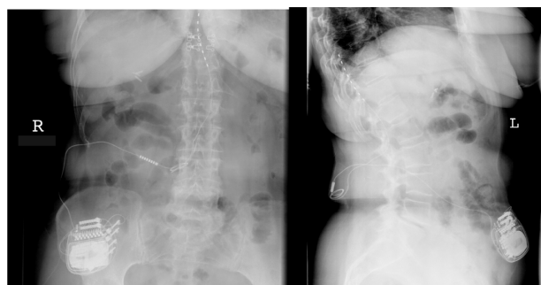
Figure 2 Anteroposterior and lateral view of a thoracolumbar spinal cord stimulation placement; the 8-pole lead (octrode) is positioned at level TH10-12, and the impulse generator is placed abdominally subcutaneously. Abbreviations: R, right; L, left.