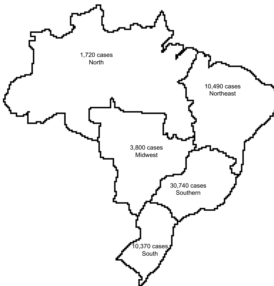
Figure 1 Representative geographic distribution of Brazilian macroregions and their respective cancer estimates for the year 2014.

Notes: The main population agglomerates are the South and Southern Regions. Data were obtained from the Instituto Nacional de Câncer (INCA) (2014). 23