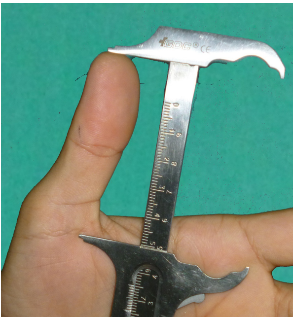
Figure 1 Measurement of thumb length.

To measure the OVD, commonly used methods in the Department of Prosthodontics, BP Koirala Institute of Health Sciences (BPKIHS) were employed (Figures 2 and 3). The subject was seated comfortably in the dental chair in a fully upright position, with the back of the subject in maximal contact with the back of the chair. A headrest was used to support the head with the ala-tragus line of the subject in a horizontal position, which was maintained throughout the measurements. He or she was made to occlude the teeth in maximum intercuspation. Then two markings were placed on the tip of the nose and the most prominent point on the chin. The distance between them was measured with a Boley gauge (Taurus 811-2, SS Medident Instruments, Sialkot, Pakistan).