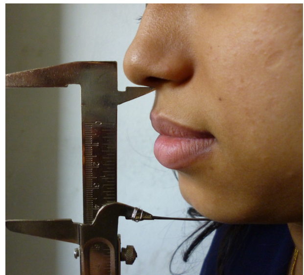
Figure 3 Measurement of OVD with modified vernier calipers.

For correlating other anatomic distances with the OVD, two other distances between the anatomical landmarks for the measurement of the OVD were also recorded. These were the distance from the rima oris to the pupil of the eye and the distance from the lateral border of the outer canthus to the tragus of the ear (Figures 4 and 5).