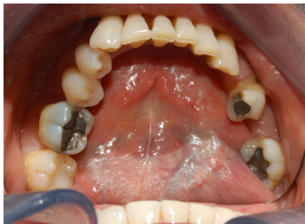
Figure 3 Dry and sticky appearance of oral mucosa in a radiotherapeutic patient.

Another issue is the high incidence of yeast infections during xerostomia. 48 An example being the C. albicans infection, which is very common in both dentate and edentulous individuals and allows a colonization of oral mucosae 49 increasing the risk of oral mucosal infections. 50