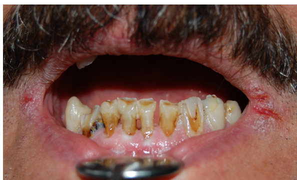
Figure 4 Cheilitis and cracked lips, and teeth cervical caries in a radiotherapeutic patient.

Therapy options in xerostomia depend on the presence of residual secretion or the absence of it. When residual