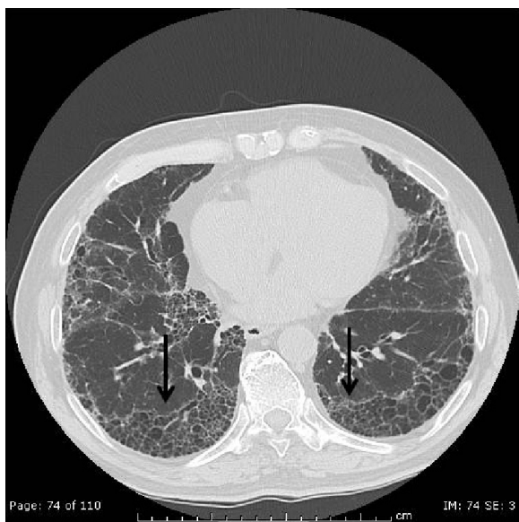
Figure 1 High-resolution computed tomography image demonstrating usual interstitial pneumonia pattern, with bilateral, basal, and subpleural predominant reticular abnormality and honeycombing (arrows).

found in several clinical settings, including collagen vascular disease, drug toxicity, chronic hypersensitivity pneumonitis, asbestosis, familial IPF, and Hermansky-Pudlak syndrome. 1 Therefore, the diagnosis of IPF requires exclusion of all known causes of fibrotic interstitial pneumonia.