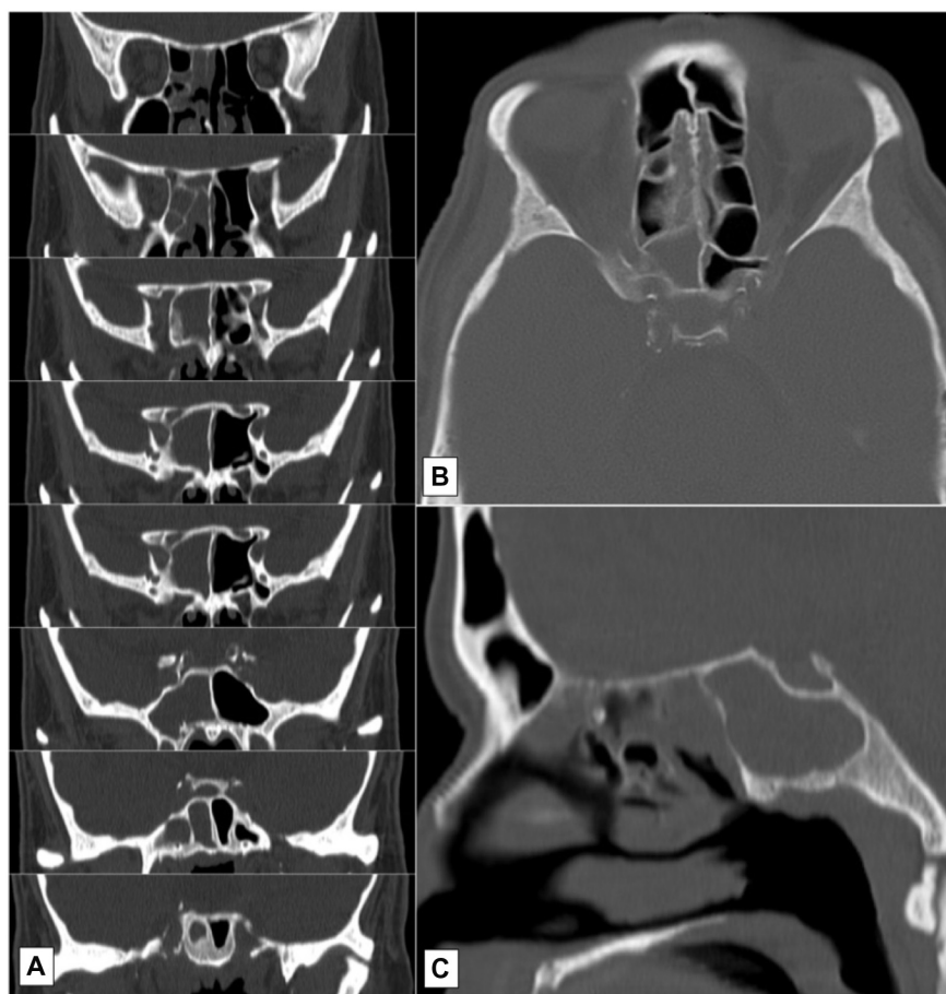
Figure 2 CT scan of the brain, without contrast.

A computed tomography (CT) scan of the brain showed bilateral opacification of the ethmoids, near complete opacification of the right sphenoid, and mild mucosal thickening in the left sphenoid and maxillary sinuses (Figure 2). Hyperintense T2 signals of the right sphenoid sinus shown on MRI suggested the presence of fungal involvement. ENT evaluated the patient and concurred with the possible diagnosis of mucormycosis.