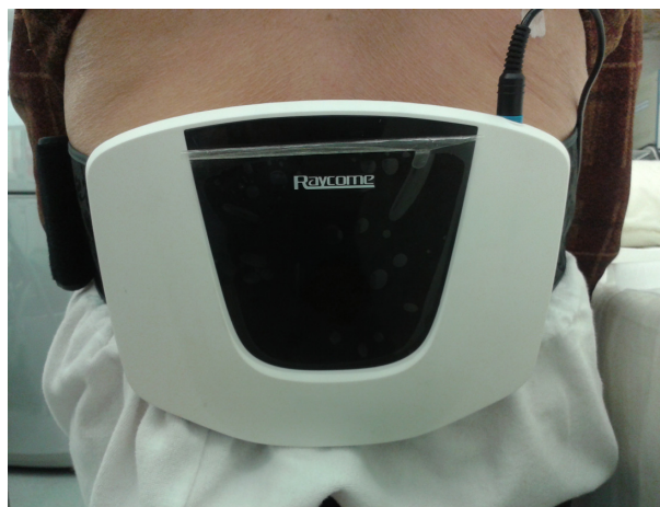
Figure 2 A patient receiving laser treatment for discogenic back pain.

The mean age of the 50 subjects was 45 (range: 36–57) years, all having had one-level disc disease documented by prior discography injection to confirm that the affected disc was the