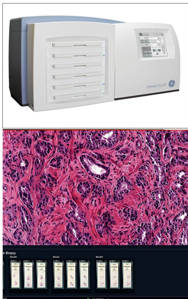
Figure 1 (Top) Omnyx whole slide imaging scanner. (Bottom) Omnyx viewer and integrated digital pathology solution that facilitates pathologist workflow. (Images courtesy of Omnyx).

The aim of this article is to review the technology and demonstrate the use of WSI for various clinical and non-clinical uses in pathology. Emerging issues related to clinical validation of these digital imaging systems and recent advances in the field are also addressed.