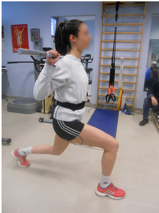
Figure 1 Lunge Exercise.

From a standing start, each participants lunges forward so that their hip and knee are flexed to 90°, the back is upright, and there is no dynamic knee valgus (Figure 1). Participants