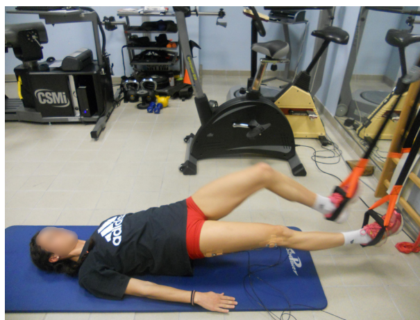
Figure 5 TRX exercise.

Note: TRX is a suspension trainer workout system that leverages gravity and your bodyweight.