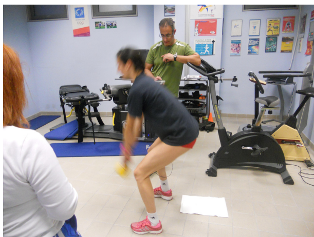
Figure 3 Kettle bell swing exercise.

in this position with the knees straight. Each knee is flexed alternately with a slow rhythm ensuring that the movement is controlled. One repetition equates to a single knee flexion on each side. This is an open kinetic chain knee dominant exercise.