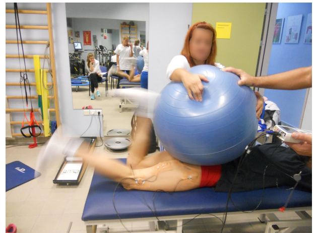
Figure 9 Fitball flexion exercise.

the ball once with each heel. This is an open kinetic chain knee flexion dominant exercise.