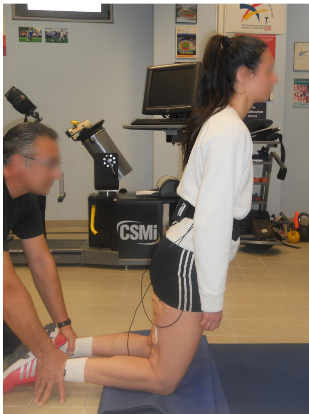
Figure 8 Nordic exercise.