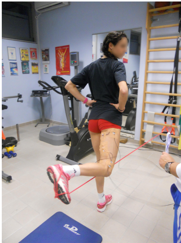
Figure 7 Curl exercise.