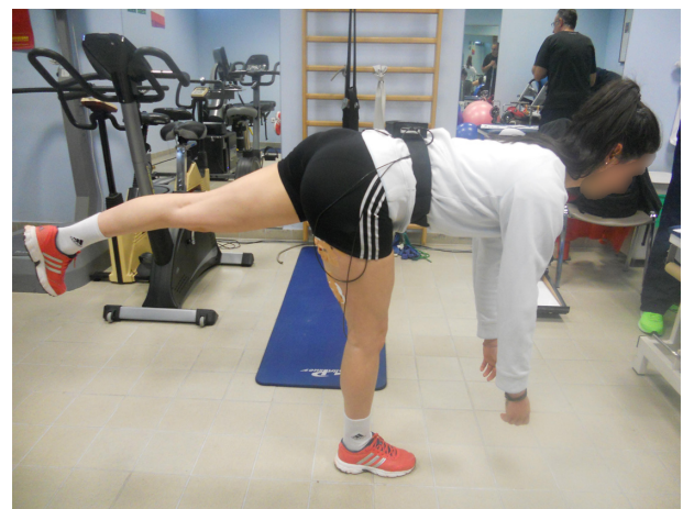
Figure 2 Single leg Roman dead-lift T-drop exercise.

The athlete is in the supine position and each foot is in the TRX straps (Figure 5). The pelvis is lifted and maintained