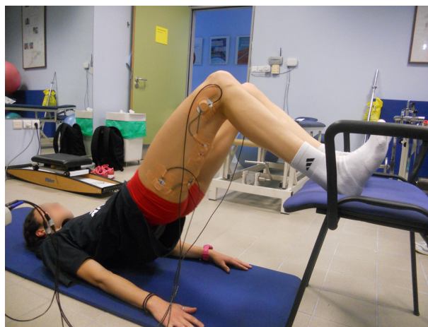
Figure 6 Hamstring bridge exercise.

Participants start lying in a prone position (Figure 9). A fitball is held at the position of the gluteal muscles, and the subject flexes and hits the ball with the heel. The right and left legs are alternated as rapidly as possible. One repetition is hitting