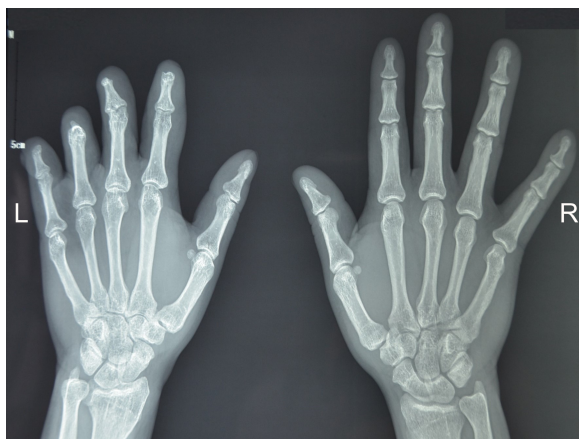
Figure 2 Male patient, 21 years old, with degloving damage involving four digits caused by machine-related trauma.

We used an embedded graft that included combined abdominal skin flaps, dorsalis pedis flaps, toe flaps, and toe-web flaps, which were naturally integrated. Abdominal skin flaps are elastic and soft, whereas foot-derived flaps are low in fatty tissues and do not roll or slide after healing with deep tissues, permitting good holding capacity in the grafted fingers. The two types of flaps integrated well, and resulted in satisfactory firmness and softness. The donor area of the abdominal skin flap was large and wide, providing enough capacity to cover the injured area on the hand. In the present study, the degloved fingers were embedded into the superficial layer of the skin fascia and laterally stabilized by abdominal tendons via the skin. This allowed one-time repair of most of the circumferential injuries of the hands. The abdominal thin skin flap was used mainly on the finger back and side, which have no critical function, and the dorsalis pedis flap, dorsal toe flap, and toe-web flaps, which were of good quality with good blood circulation and resulted in rapid return of skin sensation, were used to cover the finger-flexor side. Therefore, covering the common injured regions and reconstructing the key functions were effectively combined, so that flap resources were fully utilized. We followed our cases for 1 year, and found that sensation recovery in the palm