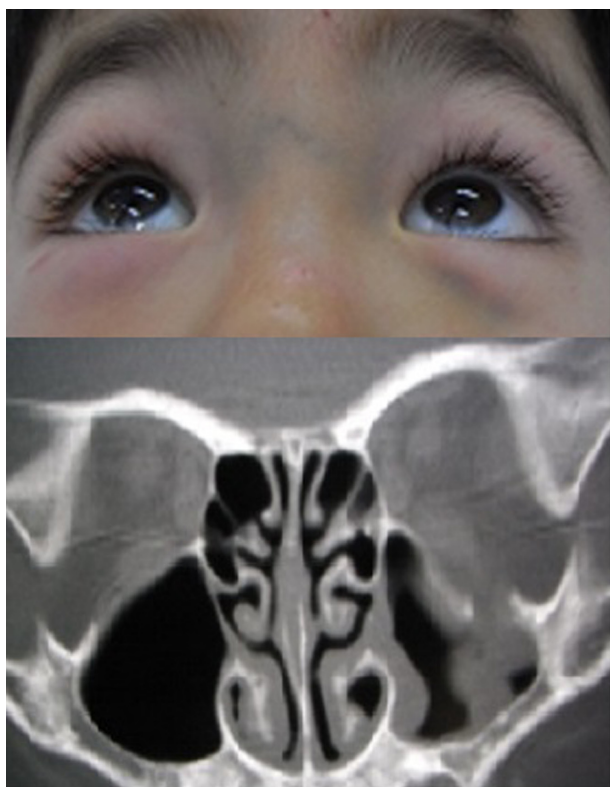
Figure 1 Computed tomography of a boy of 3 years and 3 months of age showing a pure blowout fracture of the left orbital floor with a slight dislocation of orbital contents.

Blowout fractures of the orbital floor in early childhood have usually been reported either with other pediatric maxillofacial injuries, or in a series of injuries which include adults. 6-10 In our search of the literature, the youngest reported patient that we could find was 11 months of age. 6 However, there have been few detailed case reports of blowout fractures of the orbital floor in children younger than 5 years of age. In this age period, the upper third of the developing face is more prominent and is more frequently exposed to injuries than the malar bone. Consequently, orbital roof fractures are more frequently encountered than orbital floor fractures. 11,12 In our