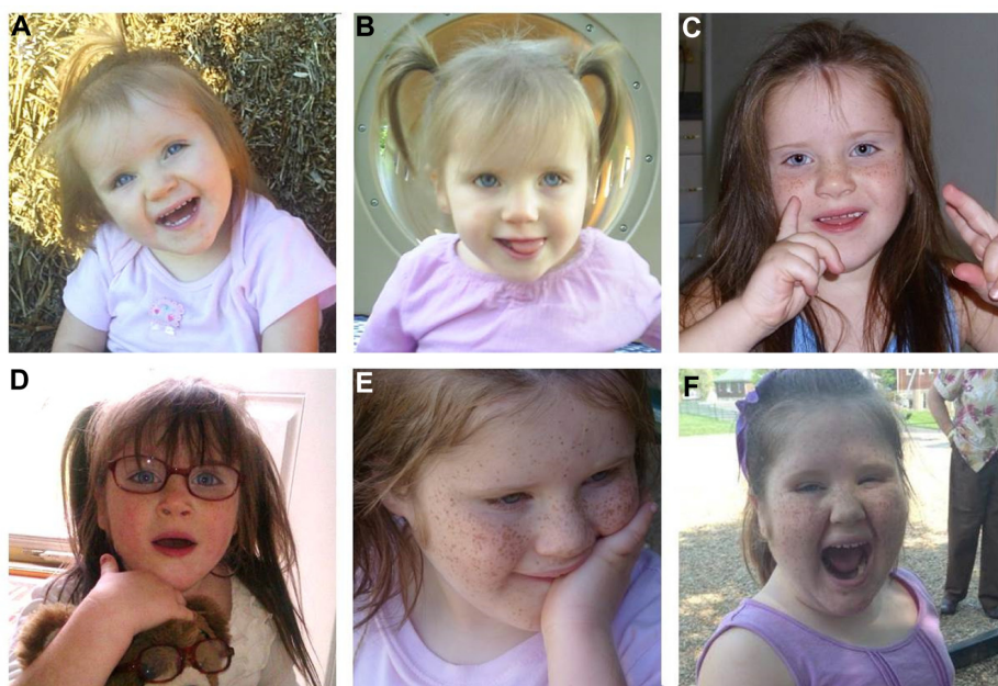
Figure 1 Facial features of a girl with a terminal 1p36 deletion (chr1:1–3,047,838; GRCh37/hg19).

In this article, we review recent successes in the effort to map and identify the genes and genomic regions that contribute to specific 1p36-related phenotypes. In particular, we highlight evidence implicating haploinsufficiency of MMP23B , GABRD , SKI , PRDM16 , KCNAB2 , RERE , UBE4B , CASZ1 , PDPN , SPEN , ECE1 , HSPG2 , and LUZP1 in the development of various 1p36 deletion phenotypes. All of the coordinates referenced in the text and figures are based on human genome build GRCh37/hg19.