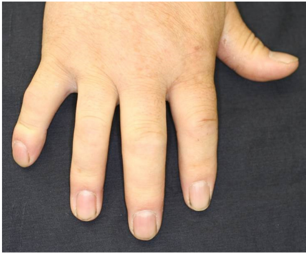
Figure 1 Dactylitis of the second and third fingers.

Moreover, dactylitis is frequently seen in spondyloarthritis other than PsA, and 59 patients (21.5%) suffered from dactylitis among 275 spondyloarthritis patients. 29 In the studies, toes were more frequently involved than fingers (78% vs 42%) in dactylitis, and the second digit was the most frequent. The digital swelling was an inaugural symptom in 10% (5/49) in PsA, and more than half of the patients with dactylitis had the first episode of dactylitis before the diagnosis of spondyloarthritis. 29 Dactylitis progresses in association with disease severity (Figure 2), even if treated with nonsteroidal