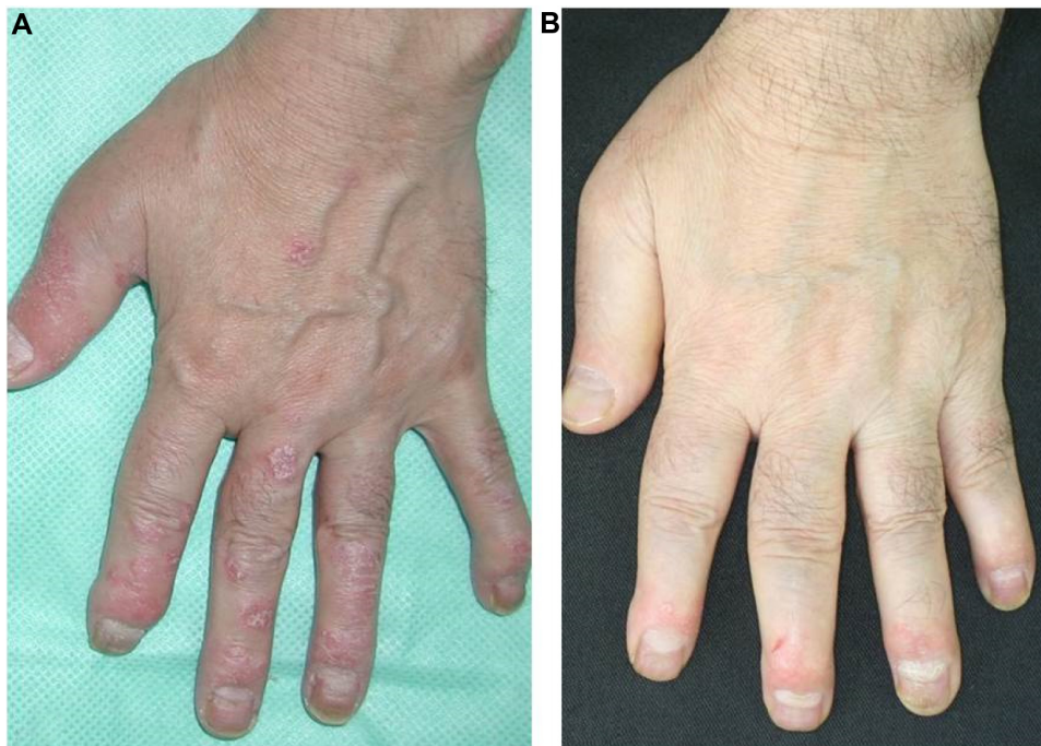
Figure 2 Progression of dactylitis.

It is quite important to detect PsA early because joint damage occurs and progresses in the early course of the disease. The “early” stage of PsA is usually used for patients with a duration of less than 2 years. 32,33 Dermatologists are uniquely poised to suspect PsA, which may lead to its early diagnosis, because cutaneous lesions precede the onset of joint pain in nearly 70% of patients. However, dermatologists may easily overlook PsA because, in general, little attention is paid to