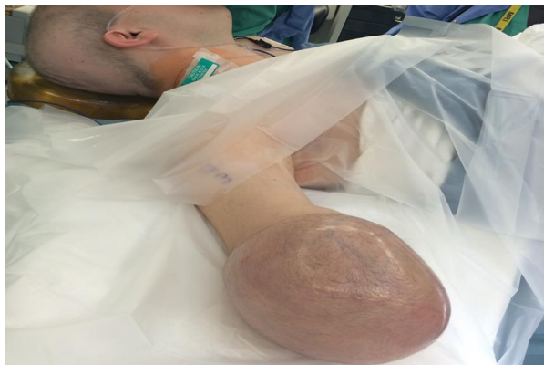
Figure 1 Preoperative photograph showing tumor progression and involvement of the area of previous amputation.