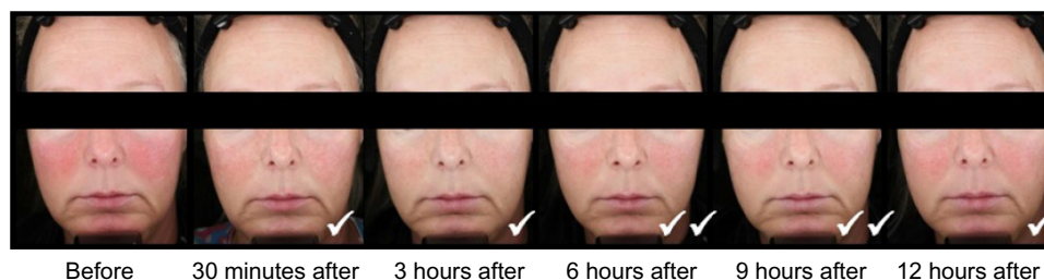
Figure 3 Standardized photos of a representative subject before and at 30 minutes, 3 hours, 6 hours, 9 hours, and 12 hours after the application of brimonidine tartrate gel on day 1.

The evaluation of brimonidine tartrate in Phase II and III studies included patient-reported assessments (PSA), demonstrating a fast onset of action and long-acting duration. 20,21,46 In a pooled analysis from the two Phase III studies, 20 patients were asked to grade their satisfaction of the overall appearance of their skin using the PAA scale. 47 The PAA can be considered a psychological anchor with five categories ranging from 0 (very satisfied) to 4 (very dissatisfied). 47 This anchor-based method allows the results to be compared with changes in PSA and CEA scores. 47 Improvements in PSA and CEA were highly correlated with improvements in PAA. For every time point evaluated, patients who achieved a one- or two-grade improvement in both the CEA and PSA scores were significantly more likely to be satisfied with the appearance of their skin (as measured by the PAA) compared with those subjects who did not achieve an improvement in CEA and PSA ( P < 0.001 ). 47 This study demonstrated convergent validity of facial erythema, as assessed by the subjects (PSA) and clinicians (CEA), and that these measures correlated with a patient-reported measure of satisfaction (PAA). 47