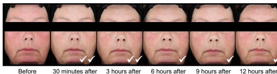
Figure 2 Standardized photos of a representative subject before and at 30 minutes, 3 hours, 6 hours, 9 hours, and 12 hours after the application of brimonidine tartrate gel on day 1.

Notes: ✓ One-grade improvement on both CEA and PSA; ✓✓ two-grade improvement on both CEA and PSA.