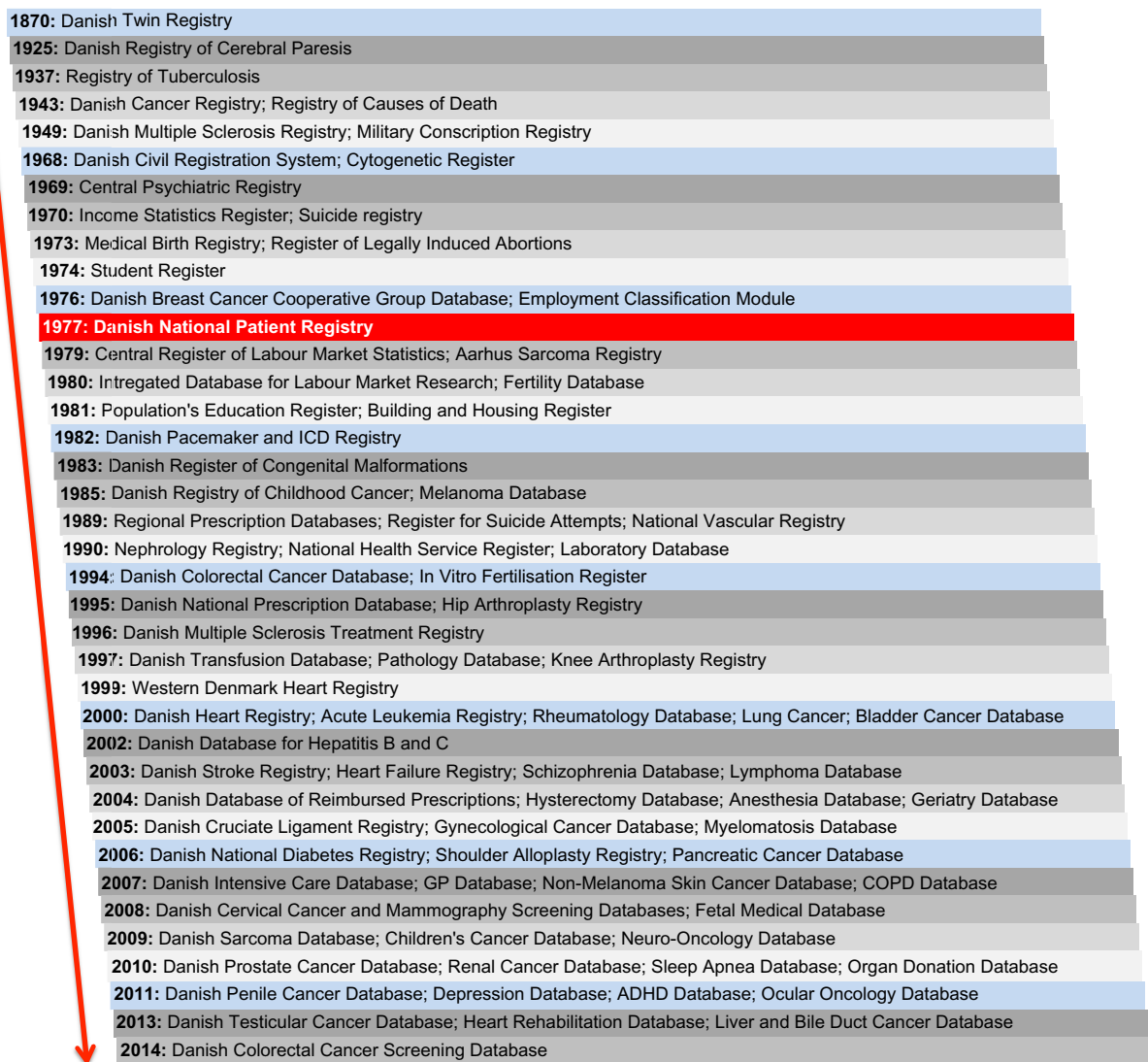
Figure 3 Timeline for the initiation of selected Danish registries linkable to the Danish National Patient Registry.

Abbreviations: ADHD, attention deficit hyperactivity disorder; ICD, International Classification of Diseases; GP, general practitioner; COPD, chronic obstructive pulmonary disease.