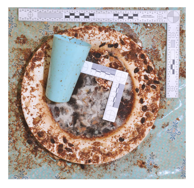
Figure 2 Plate of an unfinished meal left for 10–14 days showing extensive mold growths. The most conspicuous are Aspergillus niger (black) and Geotrichum candidum (white).

The extent of mold growth on the remains of cooked food (Figure 2) can also give indications of time. In a flat in northeast London in 2013,<sup>14</sup> evidence of this type contributed to the conviction of a mother for causing the death of a child by neglect. It was necessary to establish how long the mother had left her three children alone in a locked flat. The fungal colonies were measured and identified, and the results compared with published information on growth rates of the same