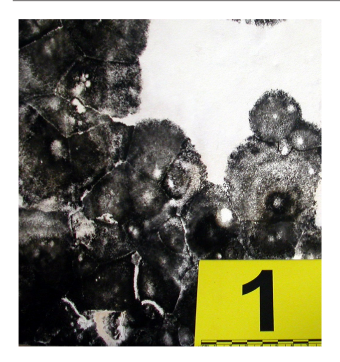
Figure 4 Colonies of Stachybotrys chartarum , the so-called "toxic mold", developed on a vertical plastered wall affected by rising damp.

ISO (International Standards Organization) standard, but a protocol for use in forensic laboratories is not yet available:<sup>29</sup> "The problem at present is that it is difficult to reproduce the same result from soil samples",<sup>30</sup> and "analyses of replicates is undertaken in less than one third of molecular ecology papers".<sup>31</sup> Some success with bacteria has been claimed in a forensic case by comparing restriction digest fingerprints rather than sequences<sup>32</sup> but, with fungi, there are major concerns regarding the use of high-throughput sequencing to assess fungal communities.<sup>33</sup> Methods are becoming increasingly sophisticated as metagenomic approaches develop, and those interested in exploring molecular methods for assessing fungi in soil samples, are encouraged to follow the development of the molecular ecology literature.<sup>34</sup>