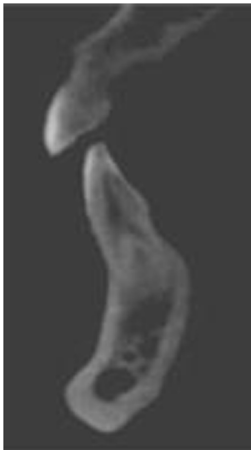
Figure 3 CBCT images showing additional canal morphology (type IX) in permanent mandibular anterior teeth.

Abbreviation: CBCT, cone-beam computed tomography.