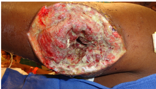
Figure 1 Large soft tissue defect from a shotgun injury to the left arm that underwent negative pressure wound therapy.

Often, with complex wounds, multiple providers are involved, such as plastic surgery, infectious diseases, orthopedics, neurosurgery, gastroenterology, the child protection program, and pediatric surgery. Wound care through PAWS is scheduled according to the availability of the patient's primary care team while other consultation services are notified. A sample of the procedures we perform in PAWS and thereby avoid use of the operating room include incision and drainage of SSTIs including complex abscesses, hidradenitis, and pilonidal inflammatory and infectious exacerbations; burn debridement and postoperative graft care; soft tissue foreign body removal; negative pressure wound dressing changes for wounds of all sizes (Figure 1); and open wound dressing changes. We routinely evaluate, diagnose, and manage chronic open wounds for orthopedic and spinal patients with or without instrumentation. Complex ostomies including ill-fitting gastrostomy appliances in enlarged stomas are treated with careful attention and often require staged wound care to allow the tissues to heal and contract around the gastrostomy button stem. PAWS patients are easily shuttled to and from radiology services, which are utilized routinely for complex