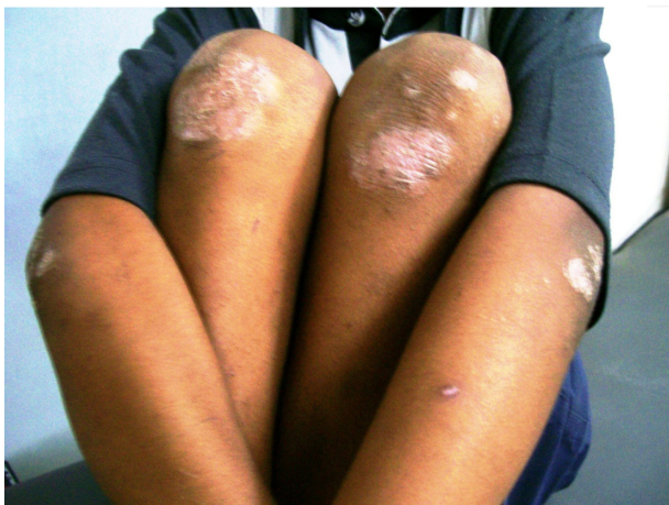
Figure 1 Erythematous scaly plaque of psoriasis over the knees and elbows.

Palmoplantar psoriasis can be of pustular or nonpustular variant. Plaque psoriasis of the palms and soles can manifest as typical scaly, red plaques similar to psoriasis elsewhere or as thickening and scaling of the palmoplantar skin, with deep painful fissures (Figure 2). Palmoplantar psoriasis tends to be a chronic recurrent condition. In many children,