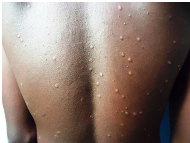
Figure 4 Erythematous, monomorphic scaly guttate papules.

Guttate psoriasis is clinically characterized by the sudden onset of drop-like small papule of 1–10 mm diameter. They are erythematous-to-pink in color, monomorphic, with fine scales predominantly occurring over the trunk and proximal extremities (Figure 4). Lesions spread centripetally, and new papules continue to develop lasting for 1 month. Lesions remain stable for a month and undergo remission by around the third month. A chronic course should arouse suspicion of evolution into psoriasis vulgaris.