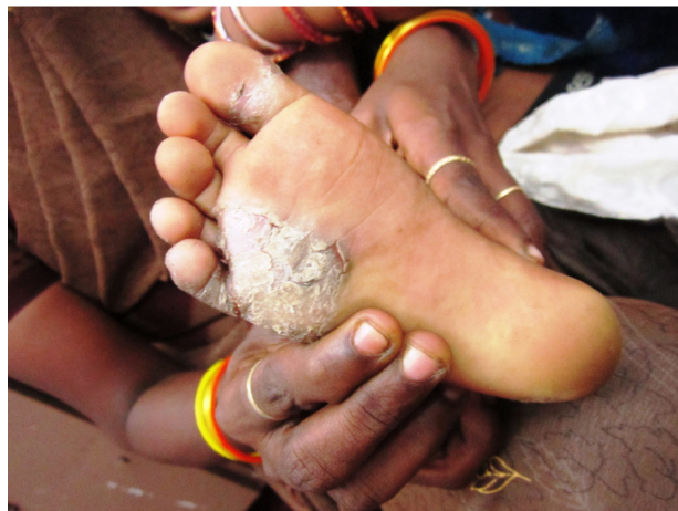
Figure 2 Thick scaly plaques with painful deep fissures.

palmoplantar psoriasis is a painful condition limiting day-to-day activities, resulting in poor school performance. Psoriasis of the palm can mimic hand eczema and may often be difficult to distinguish, as sometimes both may coexist or alternate. Well-defined margin and absence of vesiculation are clues toward psoriatic etiology. Thickened dull red skin over the knuckles is an additional finding sometimes observed in palmar psoriasis.