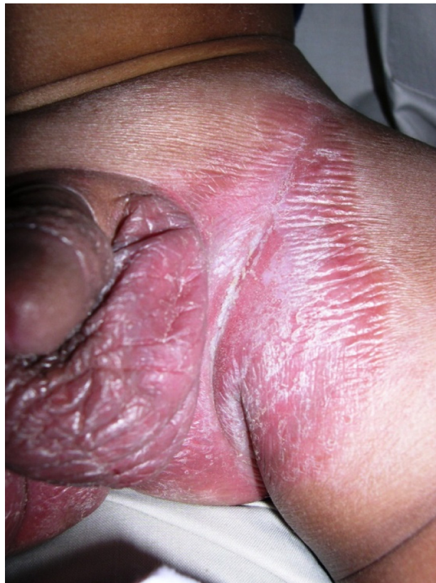
Figure 7 Erythematous smooth, inflamed skin over the groin.

In infants, diaper dermatitis may be mistaken for psoriasis and vice versa. This can be followed by dissemination of the disease to involve the whole body. Hence, an eye of suspicion and early recognition are important.