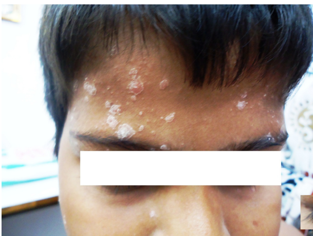
Figure 6 Sharply demarcated, red, scaly plaques over the face.

Inverse psoriasis is a variant of plaque psoriasis that spares the extensor surface typically affected by psoriasis vulgaris and affects the intertriginous areas with minimal or no scaling. This includes psoriasis of the flexures, napkin area, and genital psoriasis. It is characterized by smooth, inflamed lesions without scaling (Figure 7). Flexural psoriasis may occur as a primary disorder or as an isomorphic phenomenon on preexisting infective, seborrhoeic or intertriginous dermatoses. Psoriasis should be considered a diagnosis in case of therapeutic failure of intertrigo to antibacterial or antifungal agents. Similarly, candidal intertrigo should be considered a differential as there can be candidal overgrowth in flexural psoriasis. Psoriatic plaques of flexures are anhidrotic; however, friction and maceration tend to alter the clinical picture but still retain the characteristic pink color and well-defined nonscaly borders. The plaque has a glazed appearance with fissuring at the depth of the folds. Occurrence of psoriasis of retro auricular fold and external auditory meatus are the hidden signals of psoriasis and has to be differentiated from seborrhoeic dermatitis.