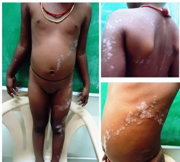
Figure 3 Erythematous scaly papules or plaques following the lines of Blaschko.

Linear distribution of psoriasis can be an isolated manifestation or can be superimposed with psoriasis vulgaris. Linear plaques distributed along the imaginary lines of Blaschko (Figure 3) may be mistaken for inflammatory linear verrucous epidermal nevus (ILVEN). Intense itching and unresponsiveness to treatment are features of ILVEN, while