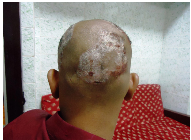
Figure 5 Circumscribed scaly plaques over the scalp.

Hairline psoriasis is an extension of scalp psoriasis beyond the hairline onto facial skin presenting as bright red thick scaly plaques. The sebopsoriasis manifests as patchy involvement of hairline also affecting the eyelid, eyebrows,