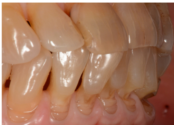
Figure 4 Abfraction lesions of different shapes, widths, and depths, characteristic of their different stages of progression.

Upon examination, shiny facets on the teeth or existing restorations may be indicators of the presence of erosive processes. Clinical features of erosive lesions also include broad concavities within smooth tooth enamel, loss of enamel surface anatomy, increase in incisal translucency, and incisal chipping and cupping out of occlusal surfaces with dentine exposure. Erosion caused by vomiting typically affects the palatal surfaces of the upper teeth, but this condition can also be caused by dietary acids. Diagnosis of erosion may not be easily accomplished because patients may not volunteer information as in cases of eating disorders, or patients may not link heartburn or stomach upsets with teeth defects. In addition, emphasis must be placed on medical conditions