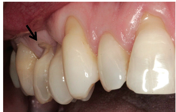
Figure 2 A typical abfraction lesion in a patient with multiple types of NCCLs. Notes: Arrow shows the second upper premolar with the typical lesion. 70 Abbreviation: NCCL, noncarious cervical lesion.

Multiple abfraction lesions overlapping one another, as the ones observed in Figure 4, seem to occur due to various forces producing tensile stress. 3,9,20 The occasional cases of abfraction lesions that are detected below gingival