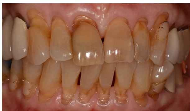
Figure 3 An elderly patient exhibiting NCCLs in the whole dentition.