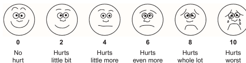
Figure 4 Wong-Baker FACES® Pain Rating Scale.

Additionally, many wound-management procedures can be painful. For example, debridement using a sharp surgical instrument can cause a considerable amount of pain. 35 Trauma at dressing removal has been documented to cause pain. 36 Clinicians should choose an atraumatic dressing that reduces discomfort with dressing changes and wear. It is for this reason that saline wet-to-dry dressings