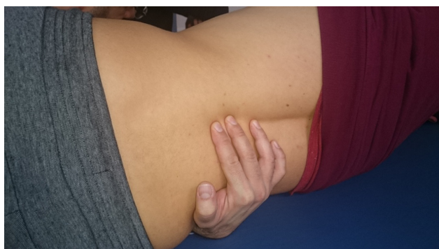
Figure 6 For medial ligaments, the spinal elasticity needs to be evaluated, with the patient being supine. The operator should hold the last phalanges of the fingers (of one or both hands) placed in the interspinous spaces of D11 and D12; by using a gentle push towards the ceiling, a passive extension of the vertebra is obtained, in order to deduce information on their elasticity.

in the interspinous spaces of D11 and D12; by using a gentle push toward the ceiling, a passive extension of the vertebra is obtained, in order to deduce information on its elasticity (Figure 6). 42 The same technique is used to evaluate the lumbar vertebral bodies up to L4. 42 The medial ligaments play an important role in the mechanics of the dorsolumbar region, in synergy with the abdominal wall muscles and the thoracolumbar fascia. 1,17,46