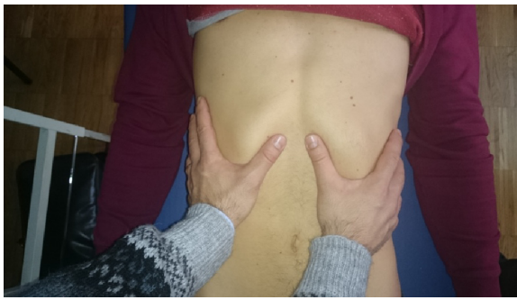
Figure 2 The hands can be held anteriorly on the costal margins, with the thumbs being at the level of the margins and the other fingers placed across the upper ribs. This manual position can be used to assess the diaphragmatic excursion.

In the following evaluation, respecting the previously described anatomy, the hands can be hold on the costal margins, anteriorly, with the thumbs being at the margin's level and the other fingers lying on the upper ribs. Since the diaphragm muscle is lowered during inspiration, and then rises during expiration, this manual position can be used to assess the diaphragmatic excursion (Figure 2). 1,17