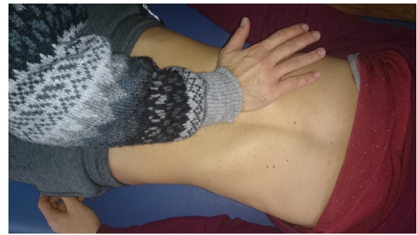
Figure 4 To evaluate the posterolateral area, the hand must be held as previously described for the domes, but with the forearm forming a 45° angle with the patient's abdomen; a gentle push must be applied obliquely, following the line of the same forearm.

To evaluate the posterolateral area, the hand must be hold as previously described for the domes, but with the forearm forming an angle of 45° with the patient's abdomen; a gentle push must be applied obliquely, following the line of the same forearm (Figure 4). This step needs to be repeated for the other side also. This portion of the diaphragm shows higher movement excursion during the respiration and has a more vertical inclination in comparison with the domes. 18