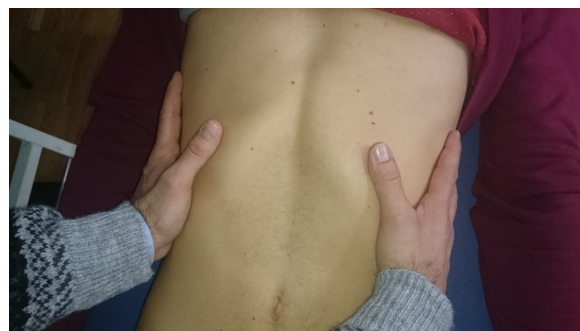
Figure 1 The hands must be gently placed on the lateral sides of the costal margins to receive palpation feedback of the costal behavior during breathing.

The patient is supine, in comfortable position. The first step deals with the assessment of the costal movement; this should consist of lateralization during inspiration, with a caudal direction, and the opposite during expiration. 44 In case of dysfunction of the diaphragm, this costal movement is usually limited. 45 The hands must be gently hold on the lateral sides of the costal margins, in order to have a palpatory feedback of the costal behavior during breathing (Figure 1).