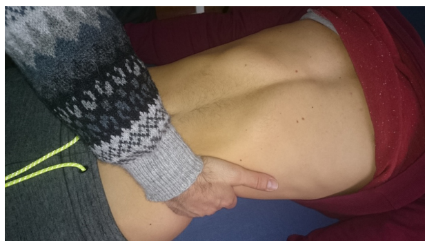
Figure 7 The lateral ligaments are evaluated by actively involving the last rib. On the opposite side of the rib to be evaluated, the body of the rib must be held with one hand, and a gentle traction must be performed toward the operator.

The main purpose of using such manual evaluation is to understand whether there is a restriction of movement in a specific area of the diaphragm muscle, in order to plan a manual treatment focused on the dysfunctional area,