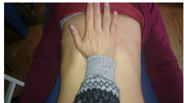
Figure 5 The evaluation of the xyphoid-costal area is used to assess whether there is regular elasticity of the tissue during inspiration and expiration, which is necessary for normal breathing. The hand and the forearm are positioned as in the evaluation of the domes, but in the xyphoid area; a gentle push must be applied cranially.

For medial ligaments, the spinal elasticity needs to be evaluated, with the patient being supine. The operator hold the last phalanges of the fingers (of one or both hands) placed