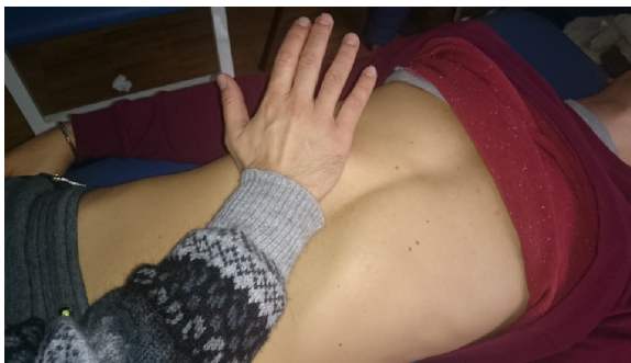
Figure 3 To evaluate the diaphragmatic domes, the operator's forearm has to be held parallel to the abdomen of the patient, with the thenar and hypothenar eminences of the hand at the level of the anterior margin of the costal arch; a gentle push must be performed in the cranial direction, so as to record the elastic response of the tissue, for both right and let sides.

To evaluate the diaphragmatic domes, the operator's forearm has to be hold parallel to the abdomen of the patient, with the thenar and hypothenar eminences of the hand at the level of the anterior margin of the costal arch; a gentle push must be performed in cranial direction, so as to record the elastic response of the tissue, for the right side as well as for the left one (Figure 3). As usually observed in manual tests, the elasticity of the tissue is reduced when a reduced movement is obtained in response to the applied stimulus. 42