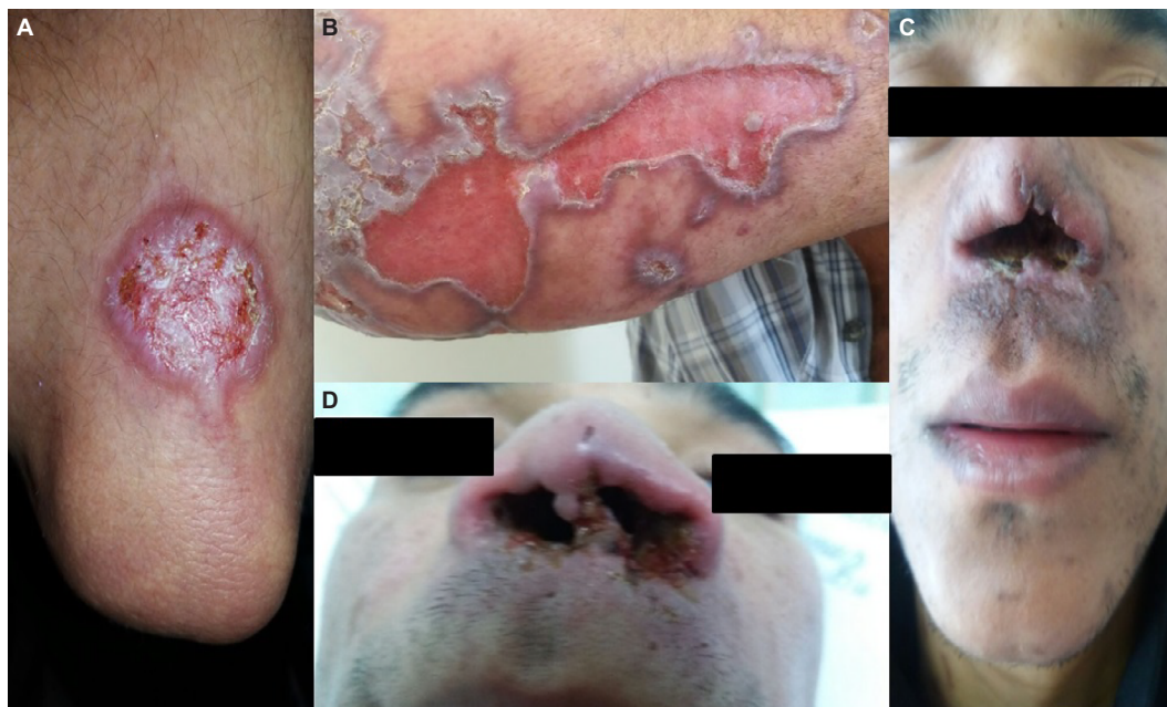
Figure 2 Lesions of tegumentary leishmaniasis.

Note: Image modified from Centers for Disease Control and Prevention. Available from http://phil.cdc.gov/phil/home.asp .