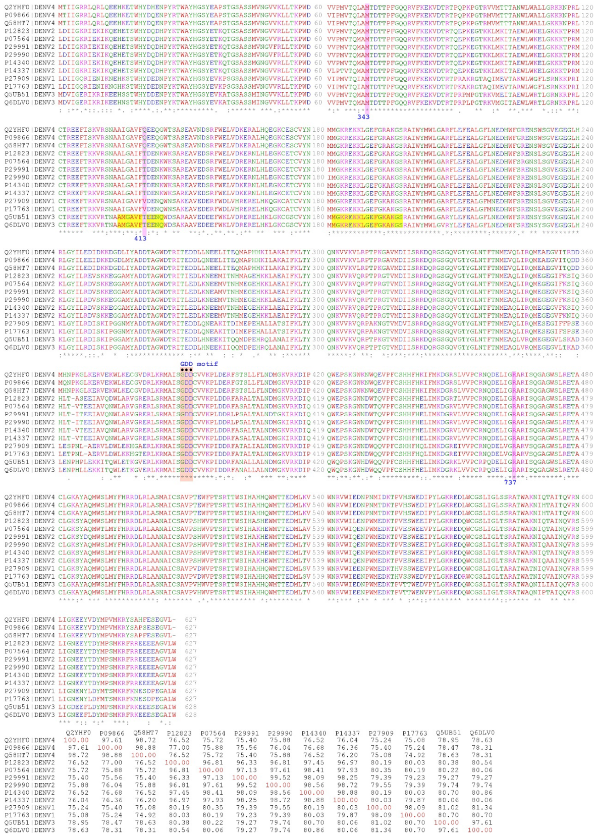
Figure 1 Multiple sequence alignment of NS5 RNA-dependent RNA polymerases of the different dengue virus serotypes (above) and the corresponding percent identity matrix (below).

Notes: Pink boxes indicate the amino acid position of M343, T413, and R737 for DENV-3 considering the full length of NS5 (MTase N-terminal + RdRp C-terminal) or the equivalent position for the other serotypes. Yellow boxes indicate missing residues in the crystallographic data. Orange boxes indicate the GDD motif. For each sequence, the UniProt code for the full polyprotein of the virus | SEROTYPE is indicated.