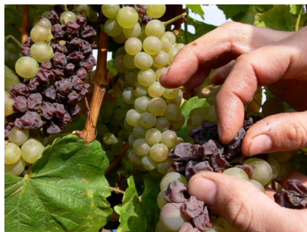
Figure 2 Selective picking of botrytized and shriveled (“aszú”) berries in Tokaj. Note: Photo courtesy of Dr Zsuzsanna Bene.

Botrytis produces numerous hydrolase and oxidase enzymes, which transform many components of the grape tissue and the juice. Oxidation of glucose leads to production of glycerol, >7 g/L, 6 but it may exceed 30 g/L after further berry dehydration, eg, in Tokaji Aszú berries and TBA grapes. 1,3 Other sugar alcohols (arabitol, mannitol, sorbitol, and inositol) and various carbonyl compounds are