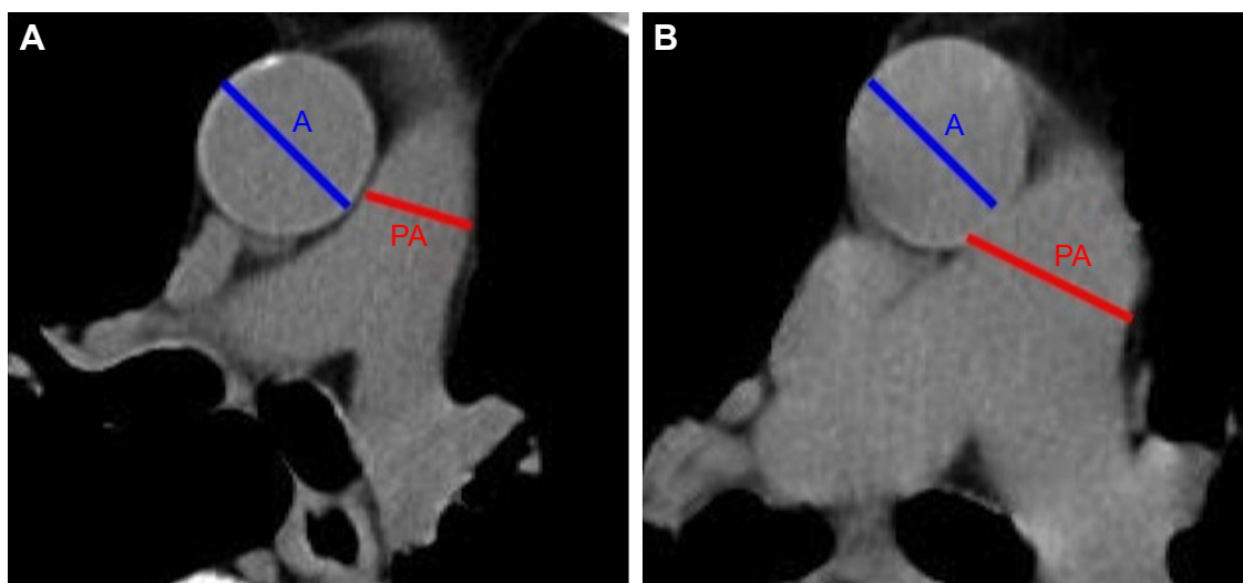
Figure 2 Measurement of the PA and A diameters at the PA bifurcation.

Differences in the PA:A ratio between both groups were driven by the diameter of PA (2.9 [2.7–3.3] cm in \text{PA:A} \leq 1 vs 3.7 [3.5–3.9] cm in \text{PA:A} > 1 , P=0.002 ), because no differences were detected in the diameter of aortae (3.7 [3.4–3.9] cm vs 3.5 [3.3–3.7] cm, P=0.20 ). There were no