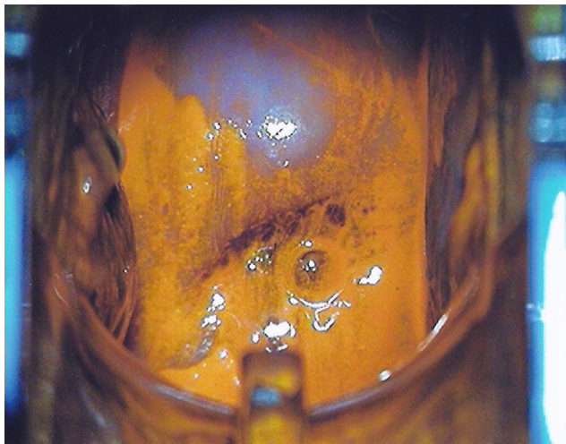
Figure 3 Intravaginal curcumin on the cervix.