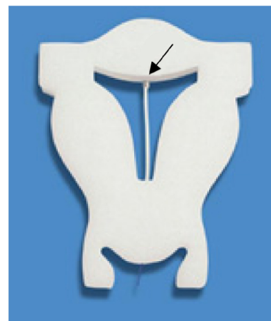
Figure 1 FibroPlant® LNG-IUS releasing 14 µg or 20 µg of LNG/day has a diameter of 1.2 mm and 1.6 mm, respectively. The stainless steel clip securing the fiber to the anchoring thread is shown (arrow).

A total of 304 women were included in the contraceptive study. Most women were parous; only 14% of the participants were nulliparous women. Women were screened for their clinical suitability for intrauterine device (IUD) insertion and compliance with the World Health Organization (WHO) eligibility criteria. 13 The experimental use of the Fibroplant LNG-IUS