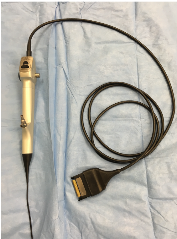
Figure 3 Karl Storz Flex Xc flexible digital ureteroscope.

Several studies have compared fiber-optic to digital ureteroscopes. A comparison was done between the fiber-optic flexible ureteroscope I1274AA (Karl Storz Endoscopy, Tuttlingen, Germany) and the digital flexible ureteroscope URF-V (Olympus Medical System, Tokyo, Japan) in 44 consecutive ureterorenoscopies (22 consecutive with the fiber-optic scope and 22 consecutive with the digital scope). 13 Maneuverability and visibility were rated subjectively on a