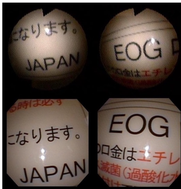
Figure 1 Images from Olympus URF-P5 (fiber-optic) on top, Olympus URF-V (digital) on bottom.

Because digital ureteroscopy utilizes the “chip on the tip” to collect information and relay it to the endoscopy tower, the bulky camera head required for nondigital endoscopic procedures is eliminated (Figure 2). In the author’s experience, the digital ureteroscopes offer improved ergonomics by being lighter and, therefore, easier to handle, something that is especially important during longer procedures where hand fatigue can become an issue. Furthermore, the reduction in scope cords from two (camera and light cord) to one helps to prevent cord entanglement and reduces clutter in the operative field. The combined cord and the elimination