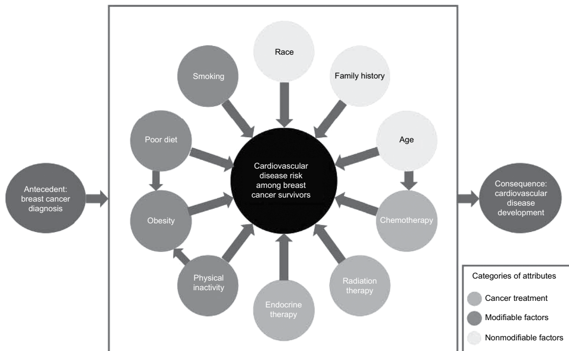
Figure 2 Diagram of cardiovascular disease risk among breast cancer survivors.

Antecedents are events leading to the concept of interest. 12 The antecedent to cardiovascular disease risk among breast cancer survivors is breast cancer diagnosis because patients become “survivors” at diagnosis. 44 Additionally, consequences are events that follow as a result of the concept’s occurrence. 12 Breast cancer survivors may develop