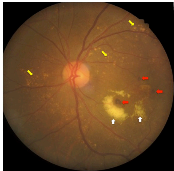
Figure 1 Fundus findings of most patients in the study.

Abbreviations: IPCV, idiopathic polypoidal choroidal vasculopathy; ICGA, indocyanine green angiography; BVN, branching venous network.